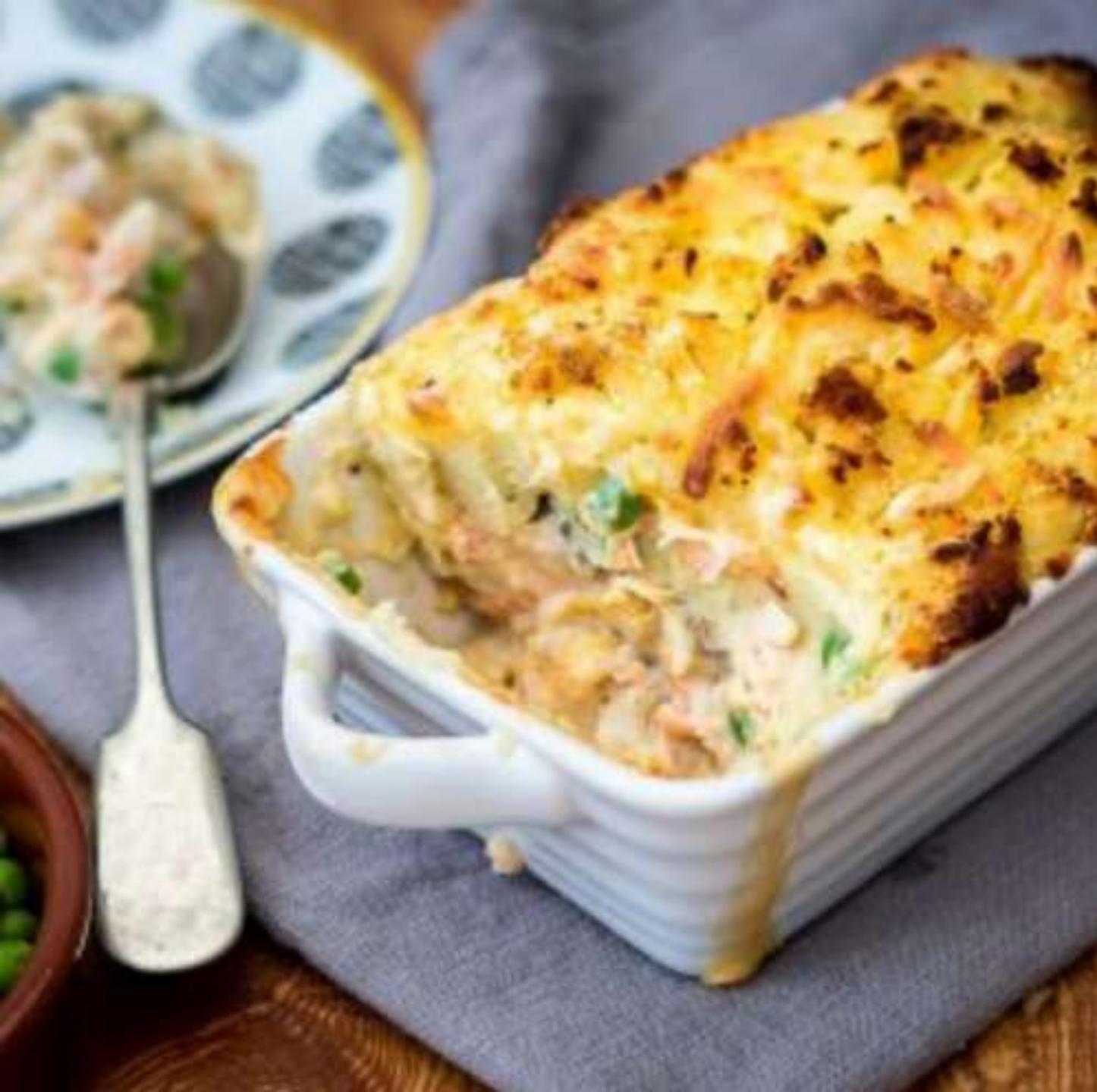
Mary's Fish pie