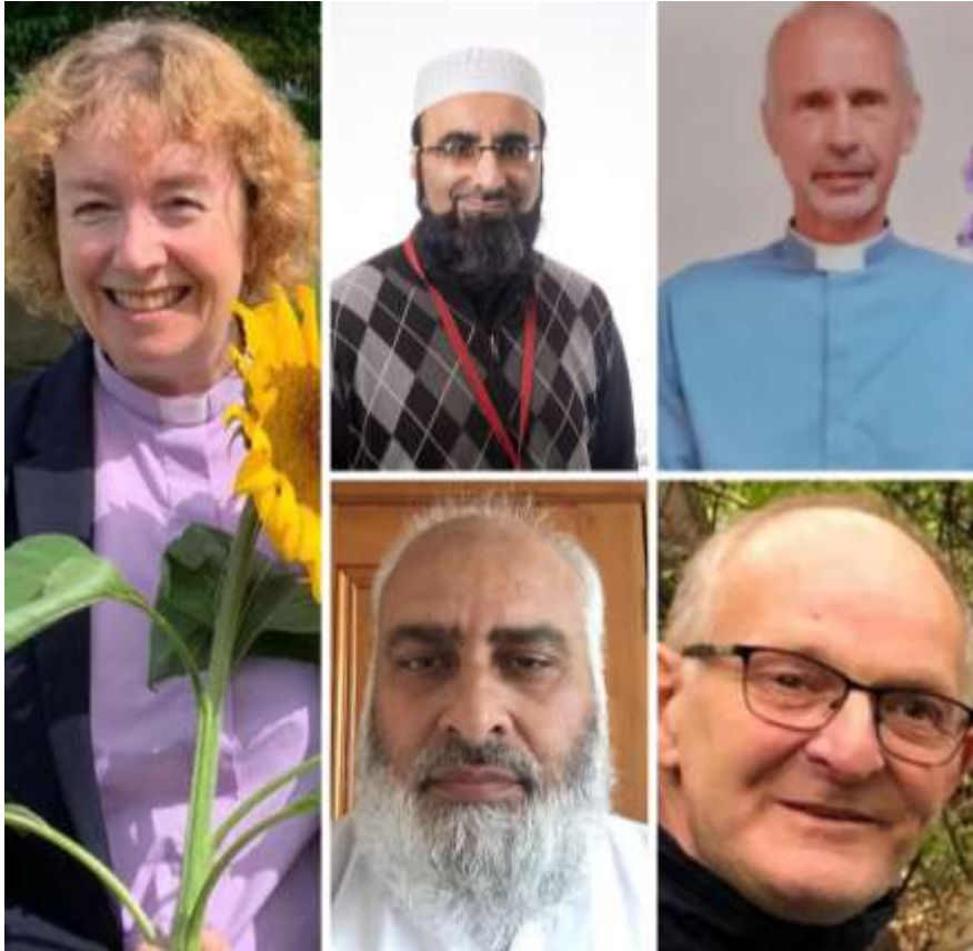
Airedale Hospital Chaplaincy Team